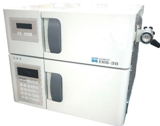
Fig. 1 NO x Analysis System ENO-30